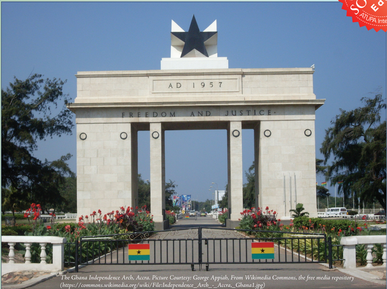
The Ghana Independence Arch, Accra.