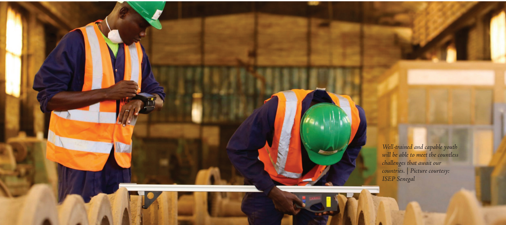
Well-trained and capable youth will be able to meet the countless challenges that await our countries.