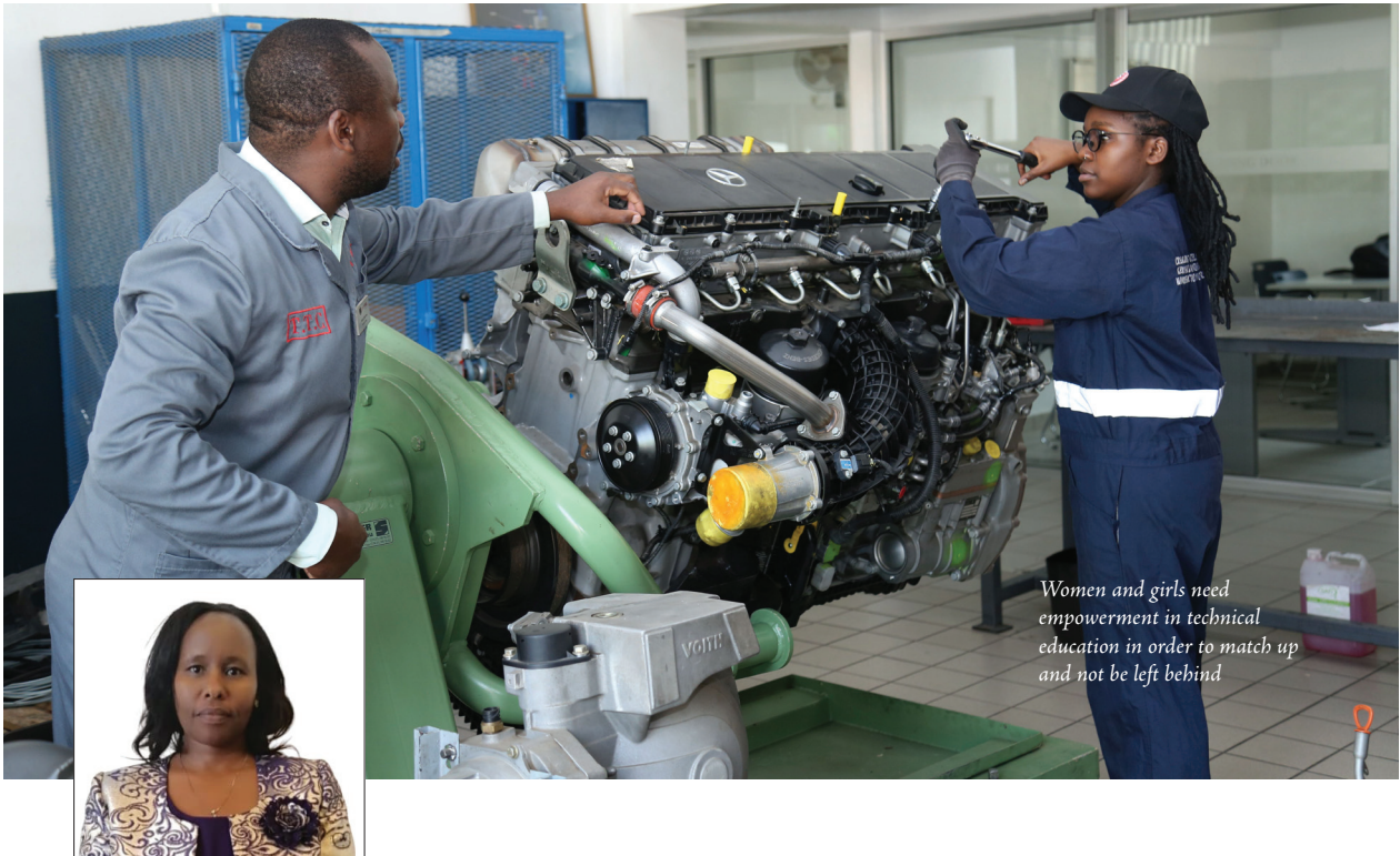
Women and girls need empowerment in technical education in order to match up and not be left behind